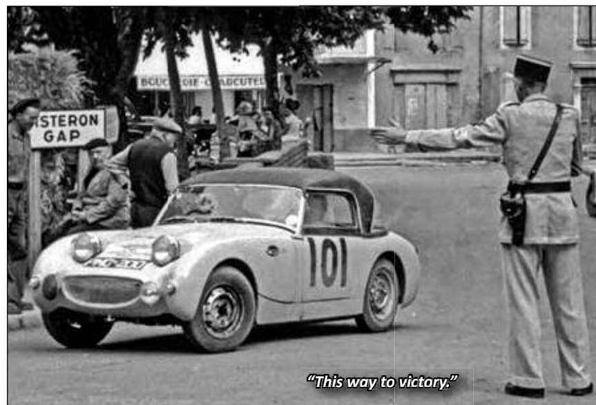
"This way to victory."

Converting the car back to right-hand drive (RHD) required sourcing a RHD dash and steering "plinth" from a California Sprite owner who abandoned converting his car. A Morris Minor left-hand drive (LHD) steering rack was acquired from a gentleman in Arizona by placing a classified ad in a Morris club newsletter. The LHD Minor rack was used on RHD Sprites by flipping it upside down. Lucky the Brits built cars from parts bins! It was not uncommon to use up last year's inventory on next year's model. An easy way to help control costs and use up old parts, but 50 years later it is the source